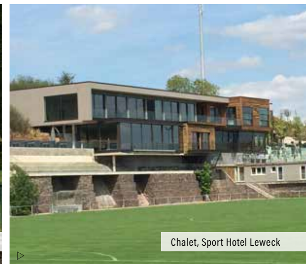
Chalet, Sport Hotel Leweck