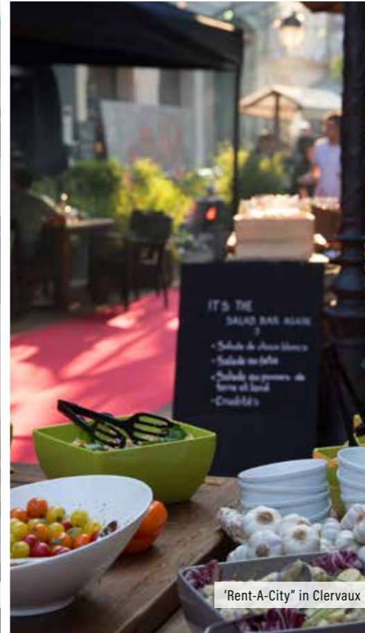
'Rent-A-City' in Clervaux