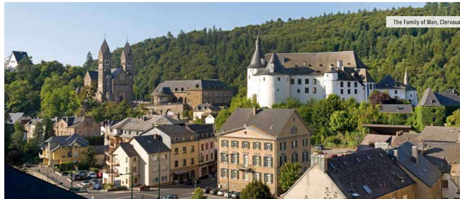
The Family of Man, Clervaux