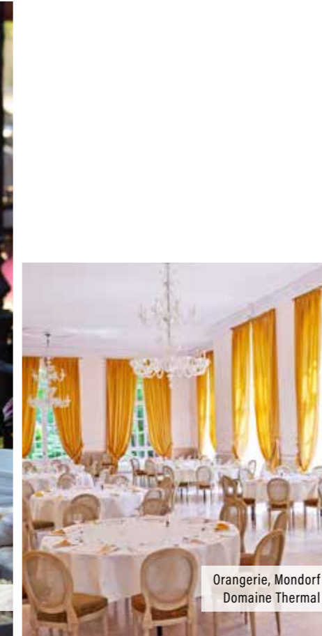
Orangerie, Mondorf Domaine Thermal